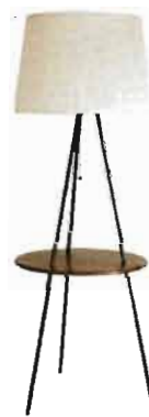
THE LEADING LIGHT by Terence Conran Benchmark