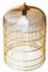
SUNRISE by Pierre Gonalons Ascète