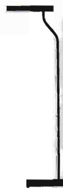
SWEEP by Massimo Orgjø Bed