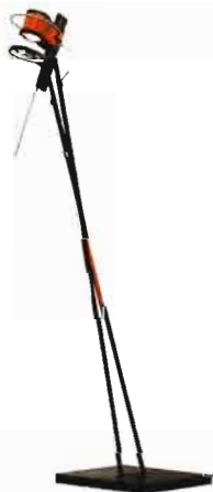
HOT.HOT by Ingo Maurer & team Ingo Maurer