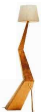
BRACELLI by Salvador Dalí BD Barcelona Design